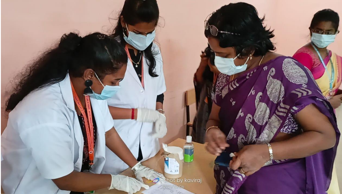
Students checked HOW SWEET! they are (“Blood Glucose” level of the faculties).