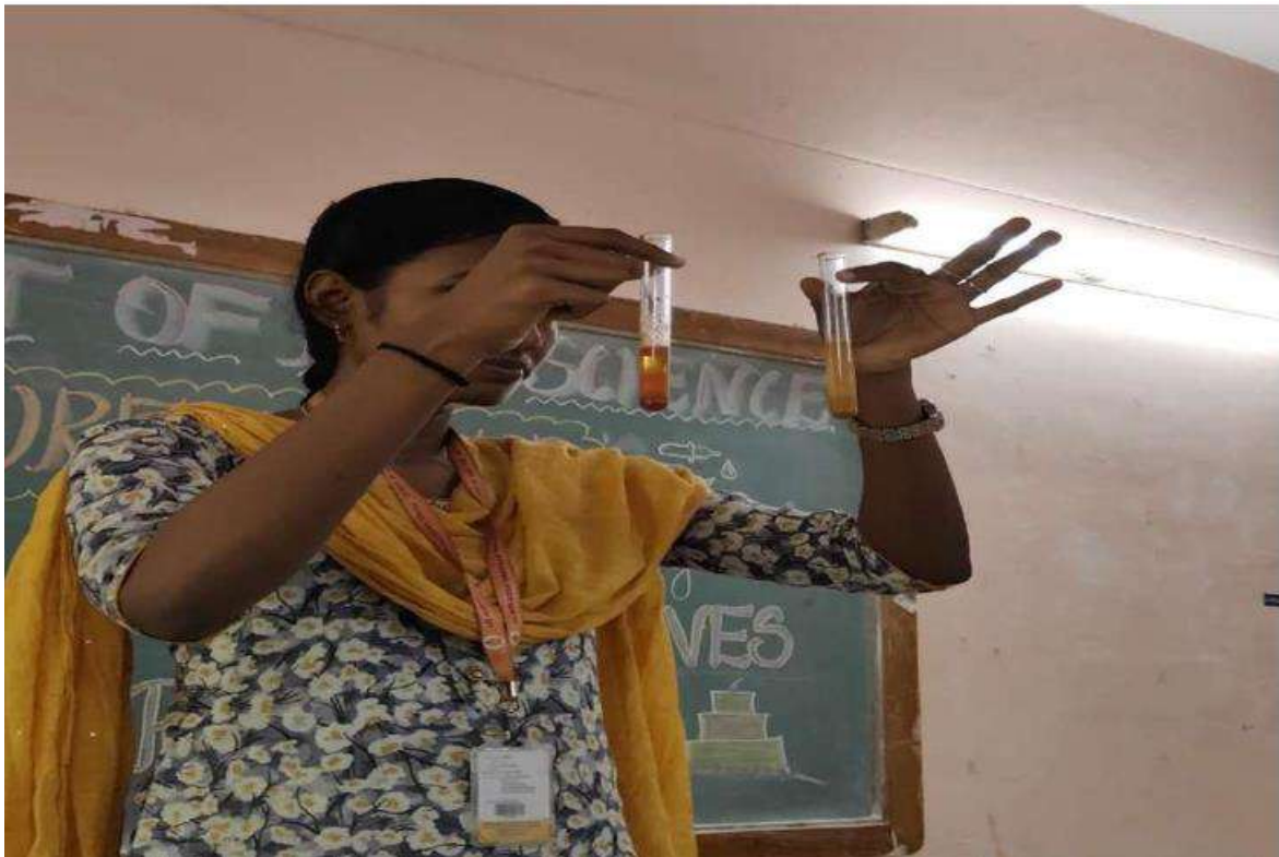
B.Sc Nutrition and Dietetics III year and II year students organised and demonstrated “Food additives in Food products” on 31.08.2024